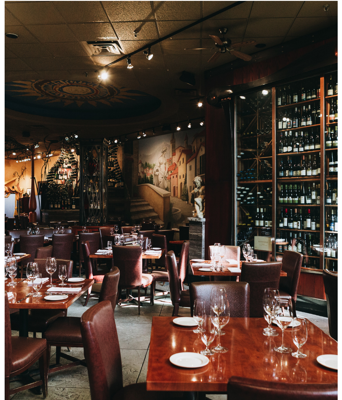
Via Allegro: Savour world-class Italian cuisine at this Toronto landmark known for its 3,000-bottle wine cellar.