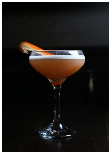
Chiang Mai: Experience a taste of Thailand close to home at this stylish spot serving flavourful dishes and cocktails.