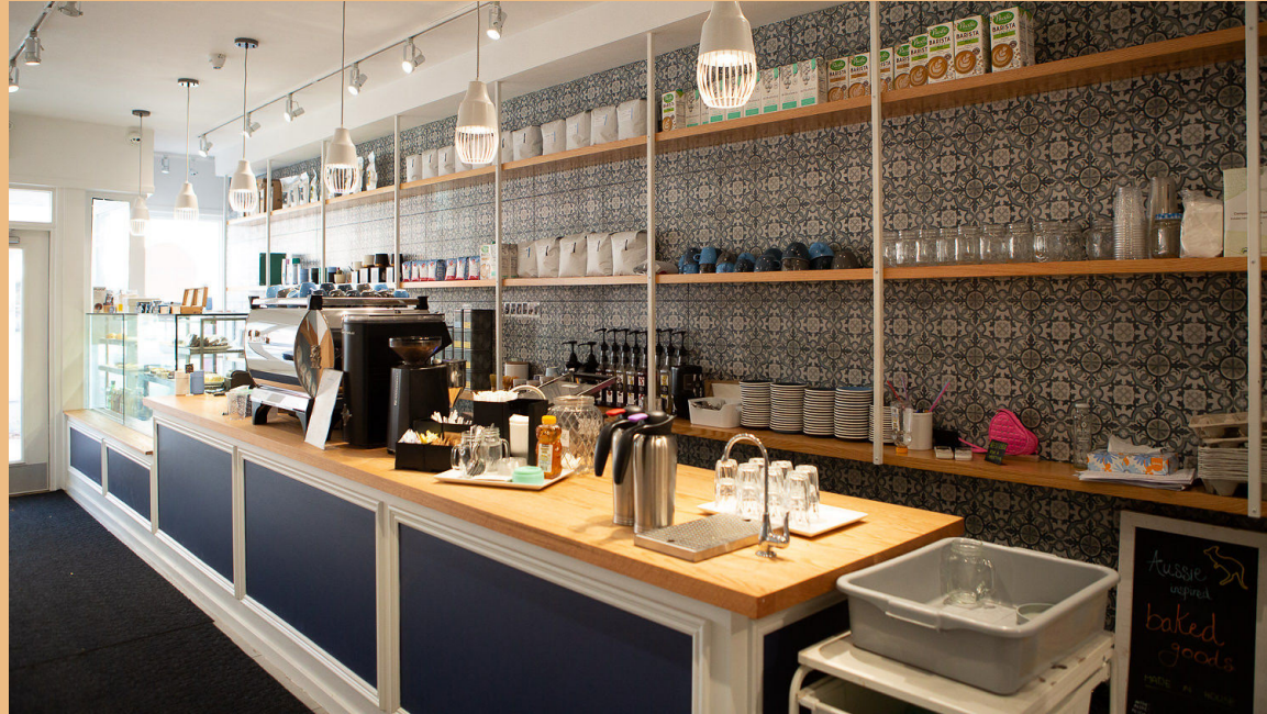
The Sydney Grind: Head down under for some Sydney-style coffee and treats at this beautifully designed, Aussie-owned café.