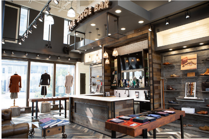
Soren Custom Suits: Find your perfect fit and suit up in style with a made-to-measure masterpiece that captures the essence of cool.