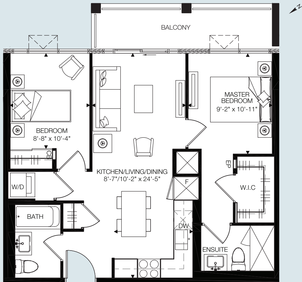
UNIT 205, 206

2 BEDROOM | INTERIOR 749 SQ.FT. | EXTERIOR 82 SQ.FT.