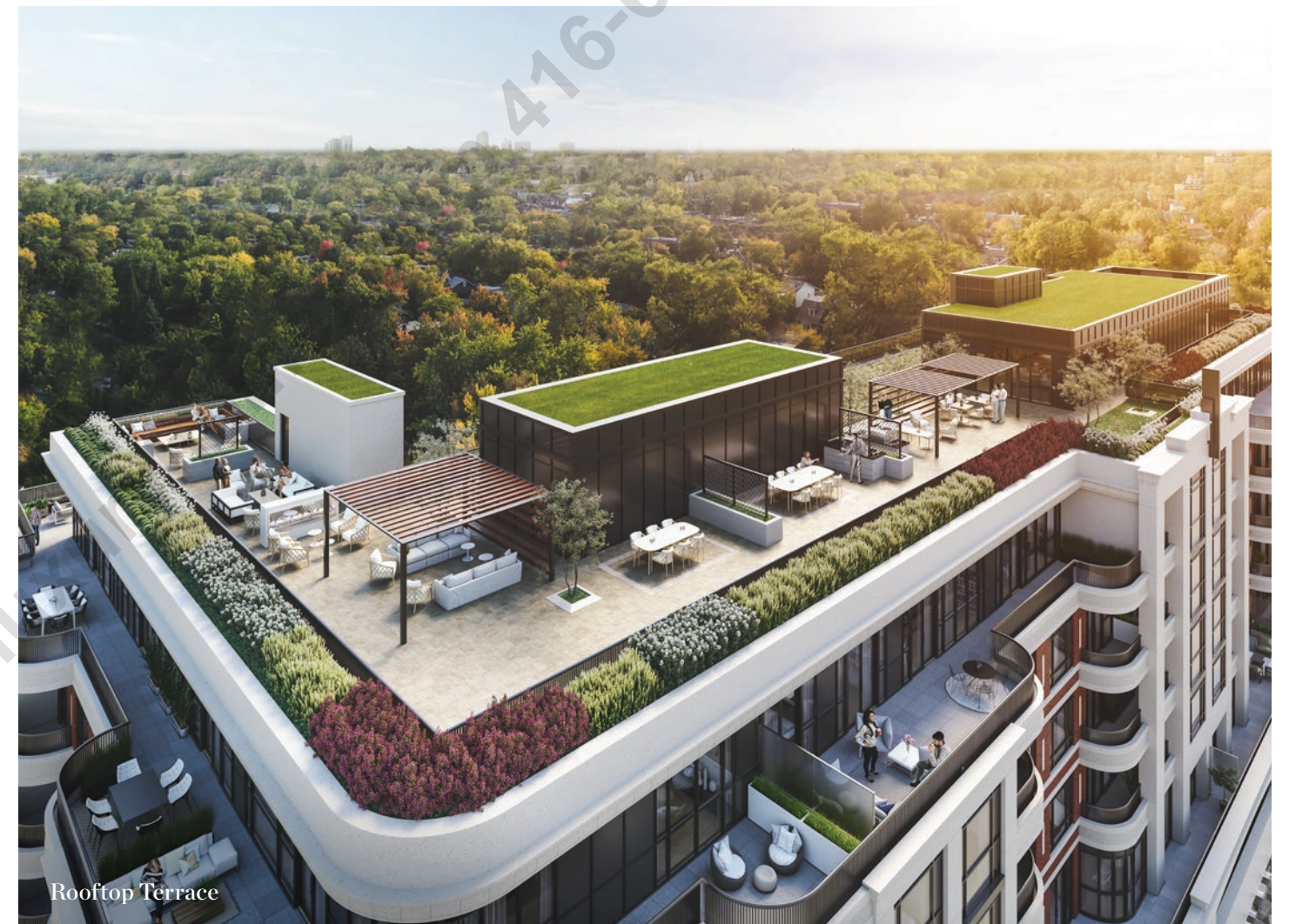
A rooftop terrace that is as breathtaking as the views.